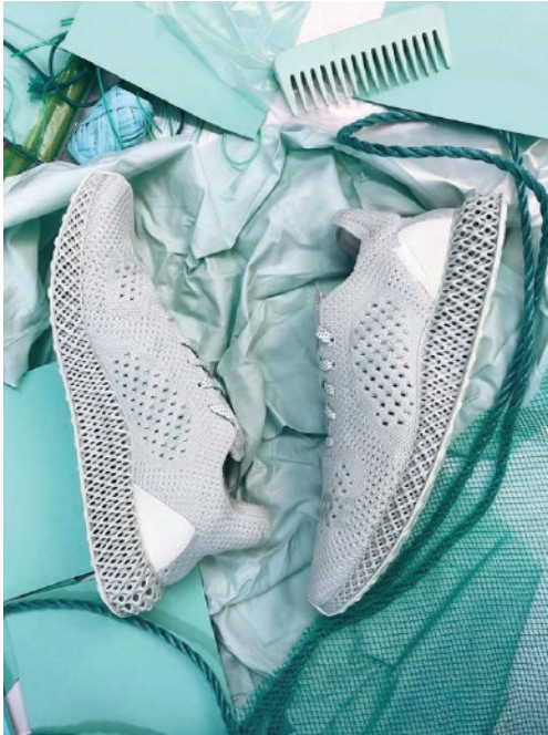
Adidas Futurecraft 4D + Studio Hagel sneakers (2)

3. Bionic beauty emphasizes the likeness of the natural and the scientific, going back to roots of renaissance where art and science were not seen as separate. It replicates ecosystems and models of the natural world in biomimicry. The signifiers mixing the real and the synthetic evoke curiosity, progress, and sustainability.