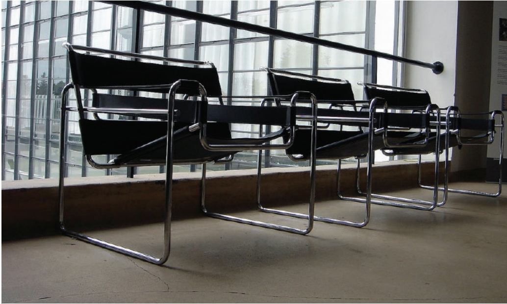
Bauhaus designer Marcel Breuer, Wassily chair (1925)

jack in recent models that pushed people to wireless listening, or the software updates that eventually clog up the memory, pushing people to larger capacities. The iPhone aesthetic religiously replicates these dreams with its materials; glossy glass backs, metallic hues, inorganic colours and a growing lack of tactility, reminiscent of the un-embodied nature of virtual space.